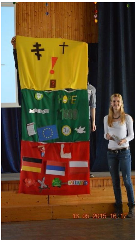
The history according to Germans...

Then Lithuanians shared their feelings about those prejudices.