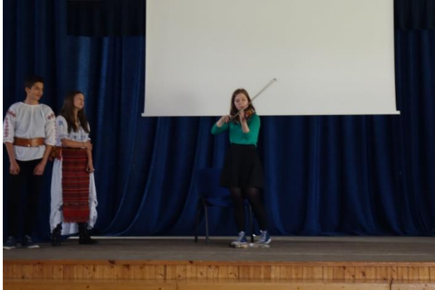
According to Romanians Lithuania is green...