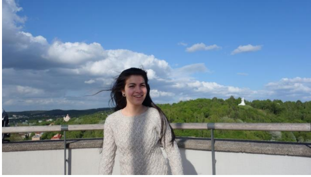
Portuguese at the top of Gediminas' Tower

The students were given the first task – to explore reality – culture of Lithuania.